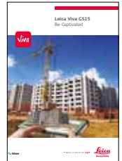
Leica Viva GS15