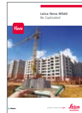
Leica Nova MS60