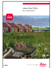
Leica Viva TS16